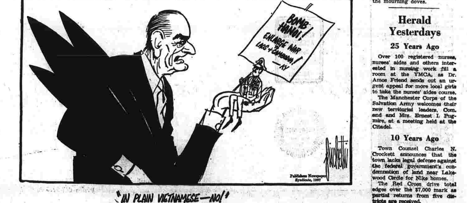
IN PLAIN VIETNAMESE—NO!